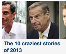
The 10 craziest stories of 2013