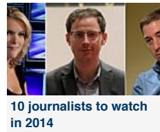
10 journalists to watch in 2014