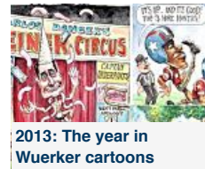
2013: The year in Wuerker cartoons