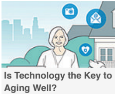
Is Technology the Key to Aging Well?