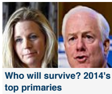
Who will survive? 2014's top primaries