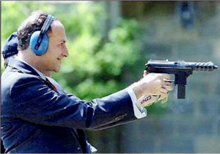
The Hon. Charles Schumer - DSCC

With the war in Iraq the single most unpopular policy of the entire Bush presidency, it does seem odd that the Democratic Party's dual campaigns to win majorities in both houses of congress are being headed by two pro-war Democrats, both of whom are warmly regarded by the Republican-leaning DLC.