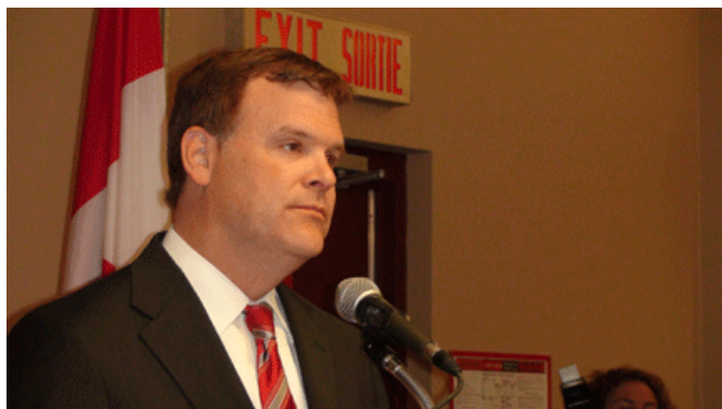
FOREIGN AFFAIRS MINISTER JOHN BAIRD