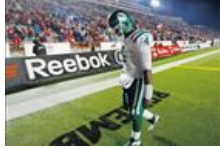
Complete Saskatchewan Roughriders coverage