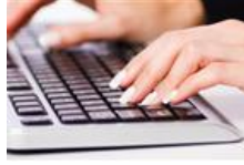
Today's SP Letters to the Editor