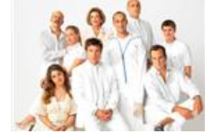
Video: Top 10 'Arrested Development' running gags