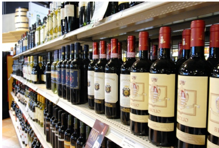
According to the provincial government, all future liquor stores in Saskatchewan will be owned and operated by private companies.