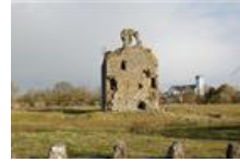
Gallery: Fixer-upper castle in Ireland -- EUR75k