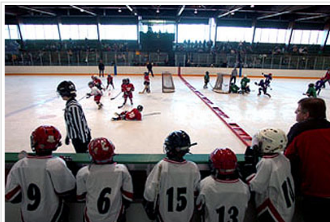
Hockey rinks and other facilities in Conservative seats received about 38 per cent more funding than others in Ontario. In this file photo, minor hockey players are seen playing in a north Toronto arena.

Toronto 23 ridings — held by 21 Liberal MPs and two NDP MPs — got about 38 per cent