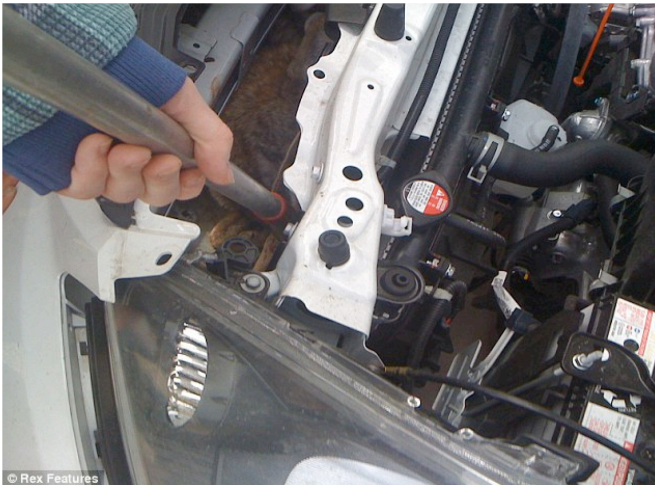
Miracle escape: As the animal struggled, wildlife protection officials put a loop around its neck to prevent it from further injuring itself

But it was only when they finally reached their destination at 9am did they take time to examine what damage they may have sustained.