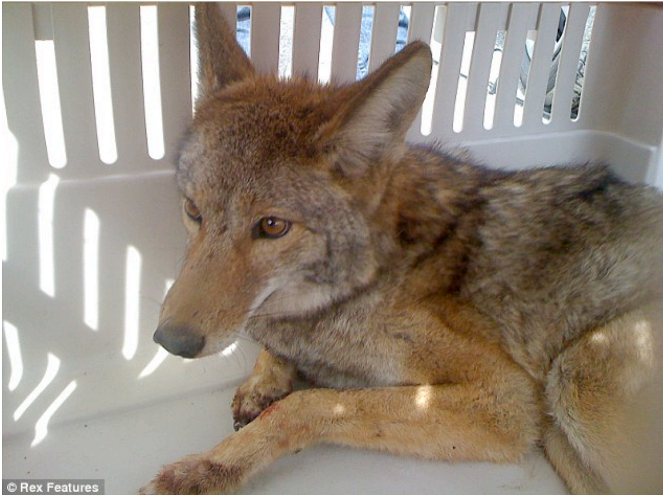
And voila! Tricky the toughest coyote ever rests in a cage after its ordeal - which it survived with just some scrapes to its paw

The pair immediately phone Wildlife Rehabilitation and Release.