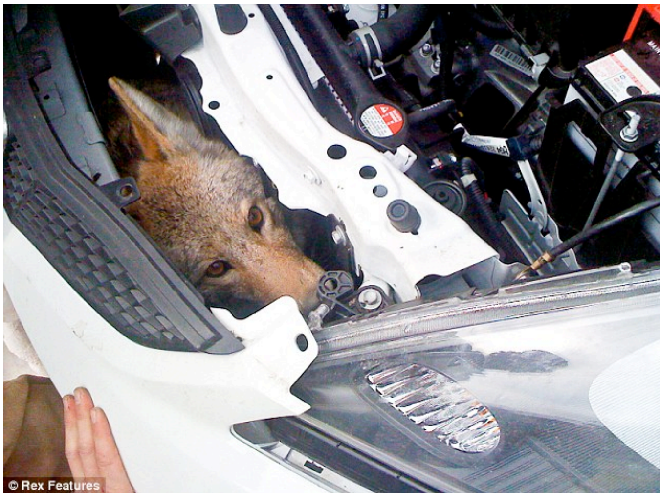
Wily coyote: The animal's head can be seen as rescuers took apart the front fender to

Eight hours, two fuel stops, and 600 miles later they found the wild animal embedded in their front fender - and very much alive.