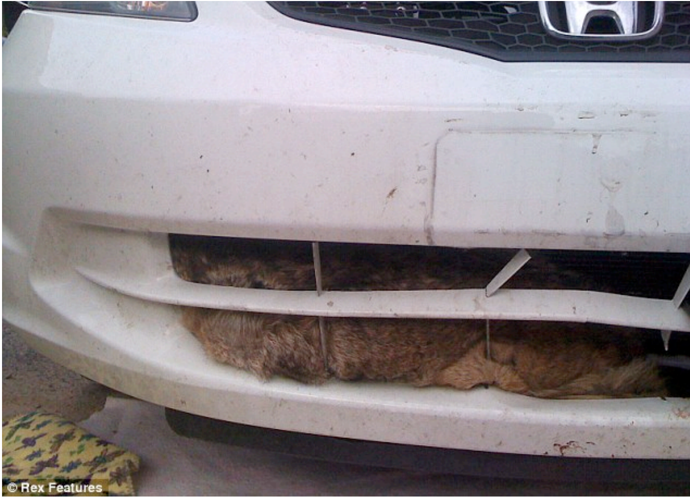
Fur Pete's sake: What Mr East spotted as he bent down to inspect the damage to his car - the body of the coyote poking out through the radiator