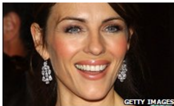
Elizabeth Hurley - almost there

British actress Elizabeth Hurley scored on the golden ratio for length, and just missed out the width measurement.