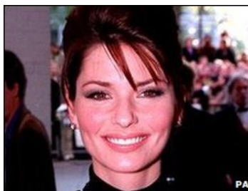
Shania Twain: The perfect face?