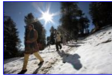
Tourists walk on fresh snow in Kufri near Shimla