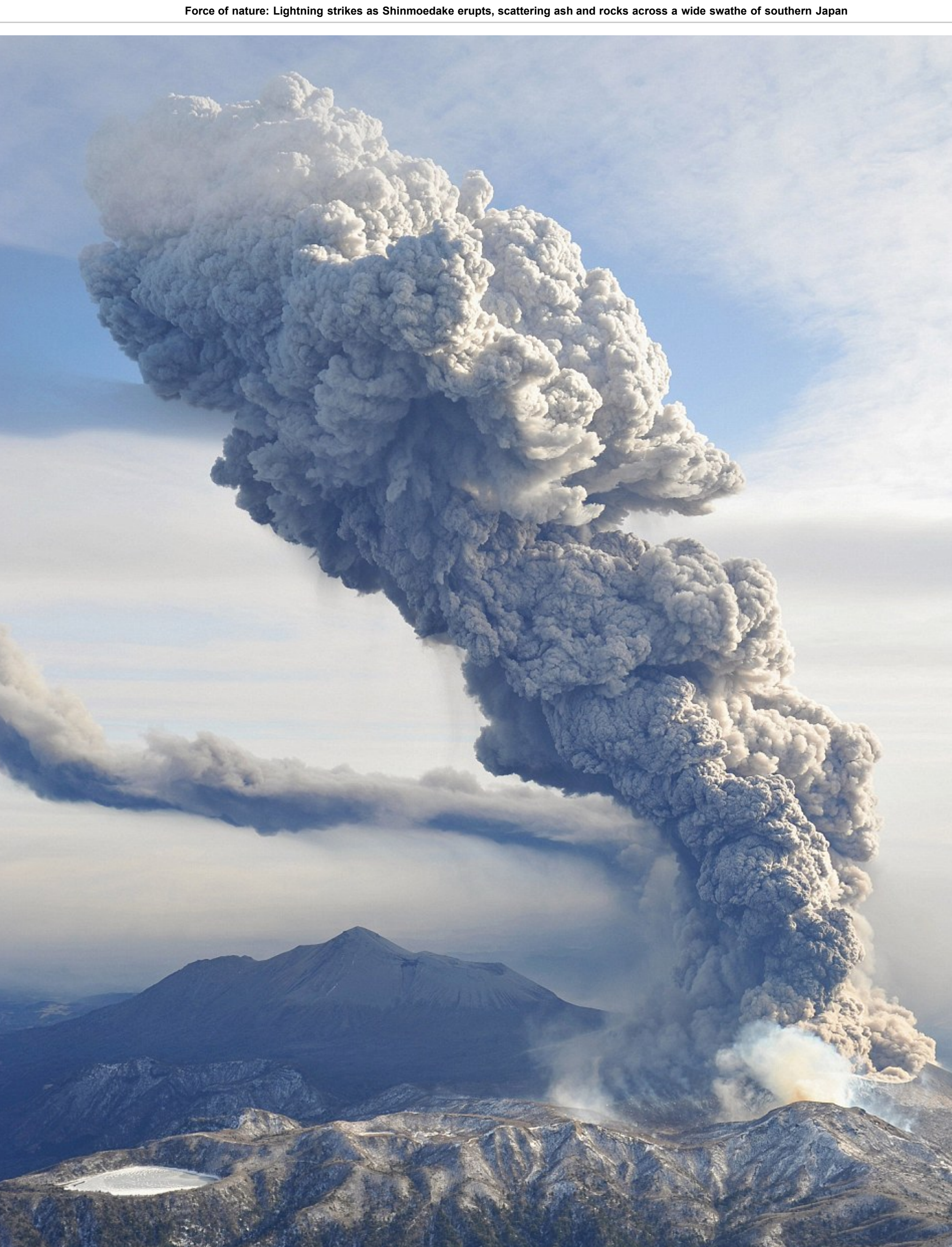
The volcano, one of 20 inside Mount Kirishima, began erupting around 7.30am yesterday morning and by 3pm heavy smoke had risen to nearly 5,000ft, prompting the meteorological agency to raise the alert level.

Ash and smoke continued to billow 5,000ft above Shinmoedake today as residents were banned from going within a mile of the volcano