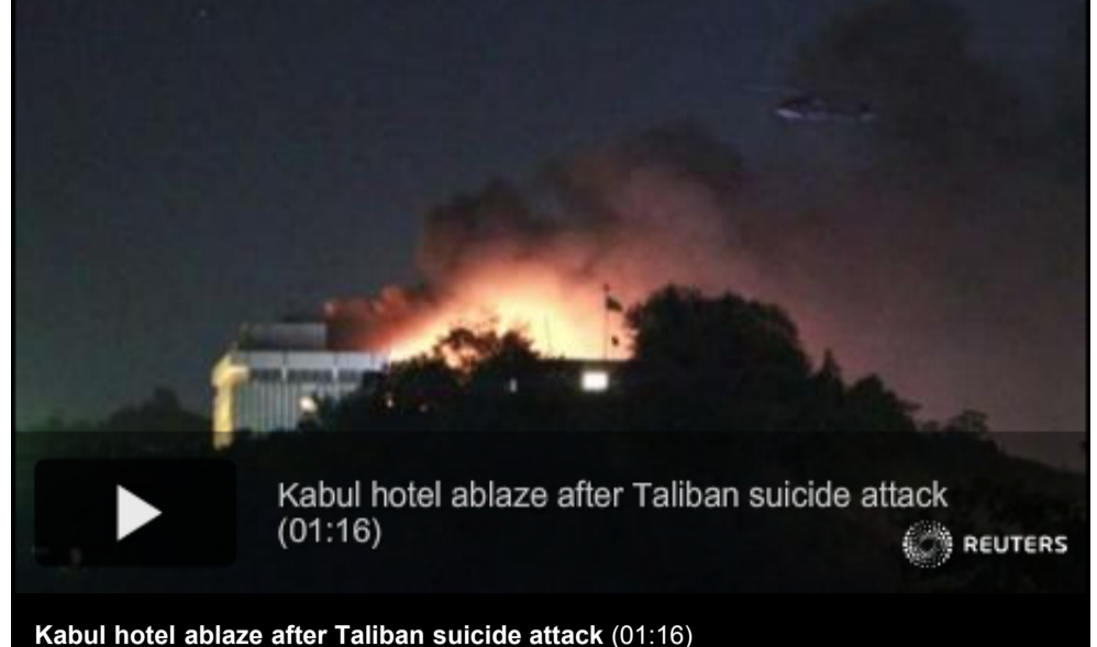
Kabul hotel ablaze after Taliban suicide attack (01:16)

Recommend 4 recommendations. Sign Up to see what your friends recommend.