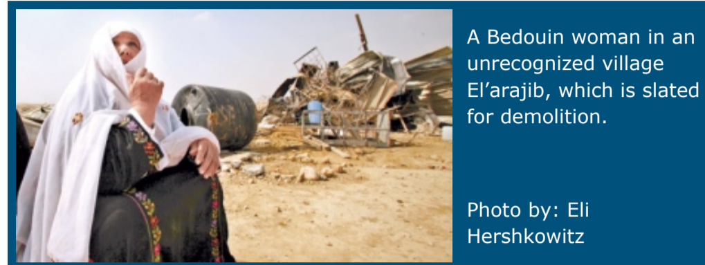
A Bedouin woman in an unrecognized village El'arajib, which is slated for demolition.

The state, through the Israel Lands Administration, told the court that the defendants had built homes in the Al-Arakib area, northeast of Be'er Sheva, on what had been state land since the time of Ottoman rule.