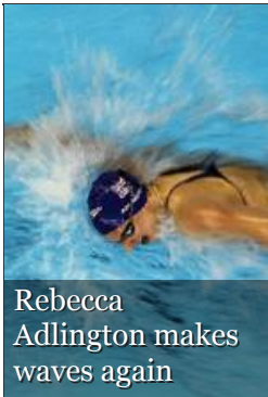
Rebecca Adlington makes waves again