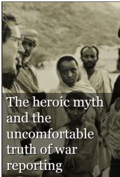
The heroic myth and the uncomfortable truth of war reporting