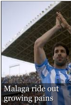
Malaga ride out growing pains