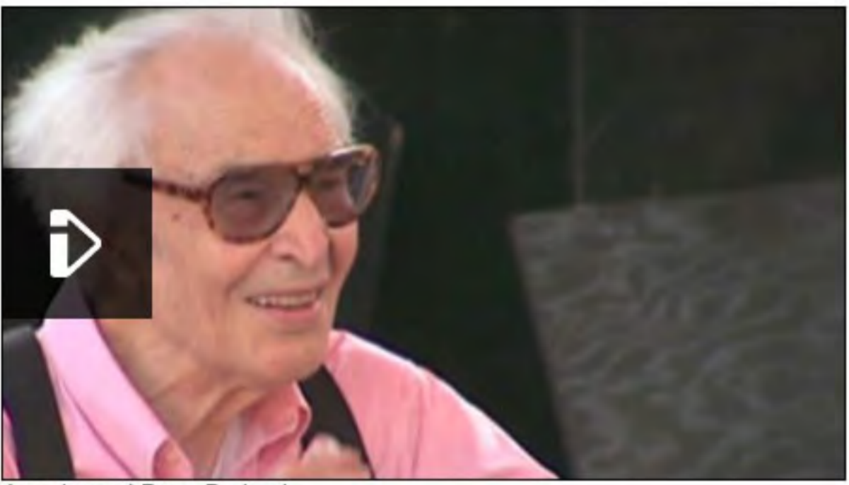
Jazz legend Dave Brubeck

Born in California, Brubeck's mother was a keen pianist, and the musician later joked that he had been introduced to the instrument while still in the womb.