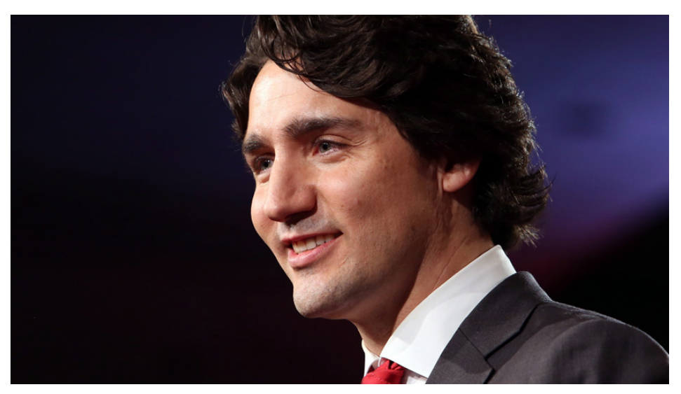
Justin Trudeau, the eldest son of former prime minister Plerre Elliott Trudeau, was elected on the first round with 24,668 points — he only needed to obtain 50 per cent plus one, or a total of 15,401 points

By Leslie MacKinnon and Susana Mas, CBC News Posted: Apr 14, 2013 3:02 PM ET | Last Updated: Apr 14, 2013 7:40 PM ET 🔲 200