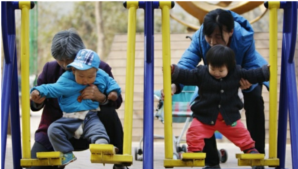
China has credited its one-child policy with managing its population growth and improving the economy, but critics say it is a violation of human rights.

The Associated Press Posted: Dec 28, 2013 10:36 AM ET | Last Updated: Dec 28, 2013 10:36 AM ET