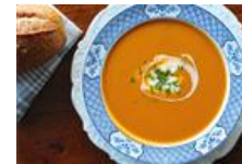
Best of food and drink this week