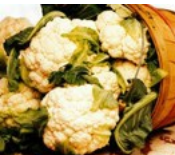
Cauliflower popcorn recipe