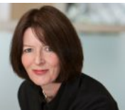
CBC exec breaks silence on Ghomeshi ...