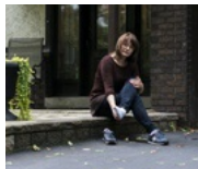
How to deal with plantar fasciitis