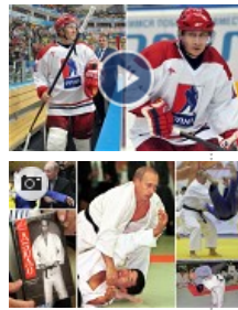
In pictures: Russia's man of action

Inside Russia, the decision was extremely popular. A poll by Levada last month suggested 86 per cent of the population was in favour of the takeover. The Kremlin portrays it as a response to years of US unilateralism, foreign snubs, hypocrisy and interference in Russia's sphere; more simply, a giant yah-boo-sucks to the West. Now "Krym