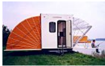
Camping Tents Worth Buying Bliss