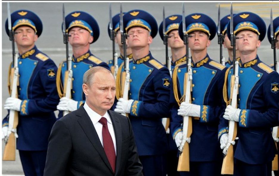
Approval rating for Russia's President Vladimir Putin at 85 per cent