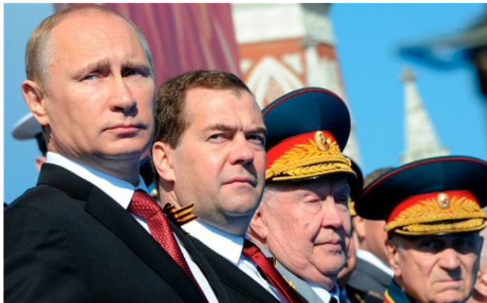
Vladimir Putin, left, and Prime Minister Dmitry Medvedev attend the Victory Day parade in Moscow

Interestingly, the state-linked WCIOM polling agency puts Mr Putin's popularity lower than Levada. It found his personal approval rating down from 85.9 per cent in May to 62.5 per cent in October.