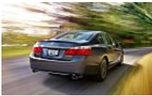
10 Unbelievable Cars For 2015 - The Honda Accord Is Our... Car and Driver