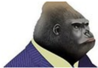
If you want to be a CEO, grow some. The Economist