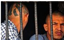
'You can recognise the gangs from their murders' 14 Nov 2014