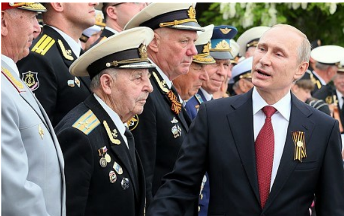
Russian President Vladimir Putin meets WWII veterans and Russian servicemen

In 2011 and 2012, mass street protests shot Alexei Navalny, an anti-corruption campaigner, onto the Moscow stage as a credible rival.