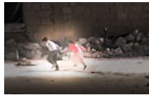
Syrian Boy Fakes Death to Save Girl Scout.com