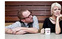
10 first date questions to avoid 21 Nov 2014