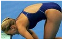
The 50 Most Perfectly Timed Photos of All-Time Perfectly Times Images