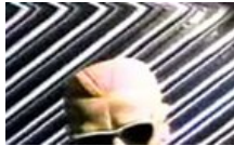
The 8 Biggest Unsolved Mysteries of the World The Daily 8