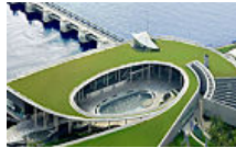
Singapore's four solutions for water scarcity Singapore Economic Development Board