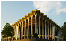
10 Most Conservative Colleges in the U.S. TheStreet