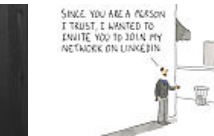
Five ways to improve your cyber security 20 Nov 2014