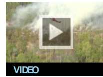
Aerial view of wildfires burning in northern Saskatchewan

Note: The CBC does not necessarily endorse any of the views posted. By submitting your comments, you acknowledge that CBC has the right to reproduce, broadcast and publicize those comments or any part thereof in any manner whatsoever. Please note that comments are moderated and published according to our submission guidelines .