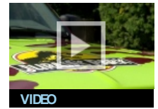
Jurassic Park fan recreates movie truck