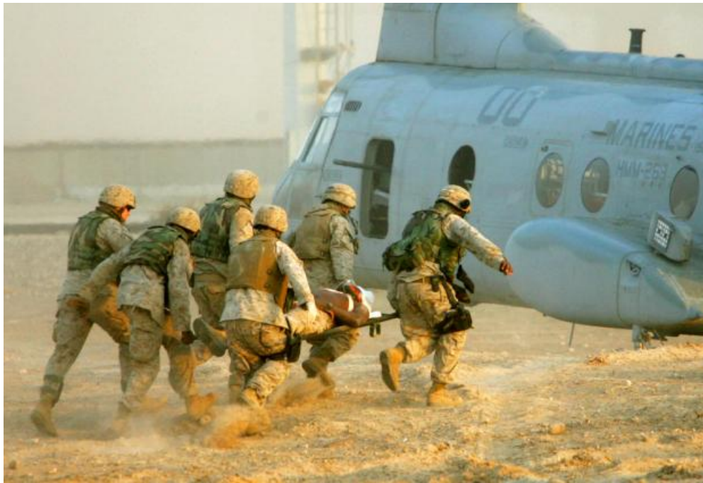
US Marines during the Iraq war, in which 4,491 US soldiers lost their lives

A detachment of US Marines has been dispatched to Iraq to join the ground fight against Isis.