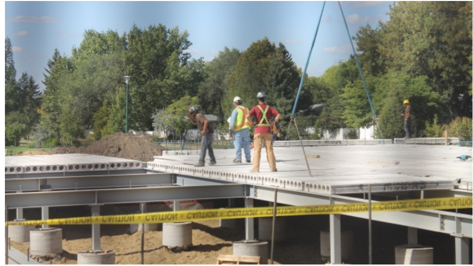
Saskatchewan's construction industry is hitting an economic downturn.

By Victoria Dinh, CBC News Posted: Apr 18, 2016 1:23 PM CT | Last Updated: Apr 18, 2016 4:34 PM CT