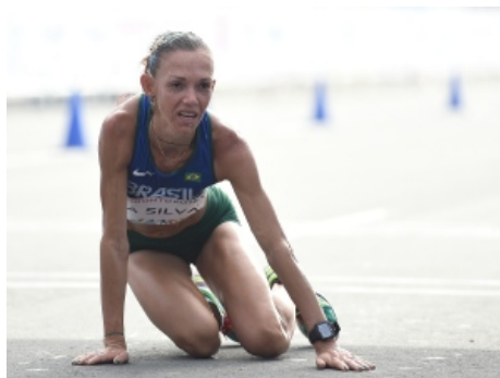
Ottawa paramedics said runners need to listen to their bodies and slow down or cool off during the race if they're not feeling well.

Organizers are even asking non-runners to pitch in. People along the courses are encouraged to run their hoses, sprinklers and have extra water and refreshments ready.