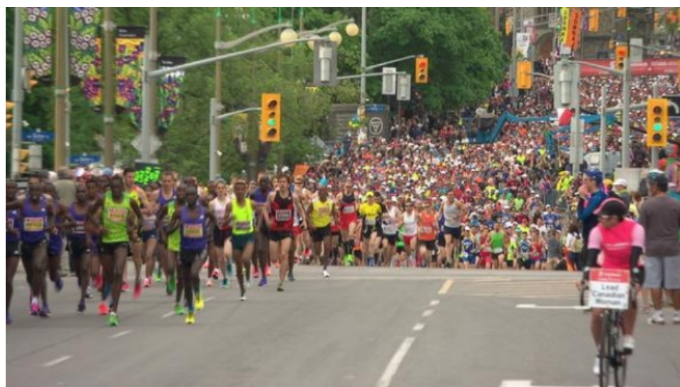
On your mark, get set, sweat. Ottawa Race Weekend is expected to be hot this year, with temperatures tipping over the 30 C mark.

CBC News Posted: May 28, 2016 10:58 AM ET | Last Updated: May 28, 2016 4:33 PM ET