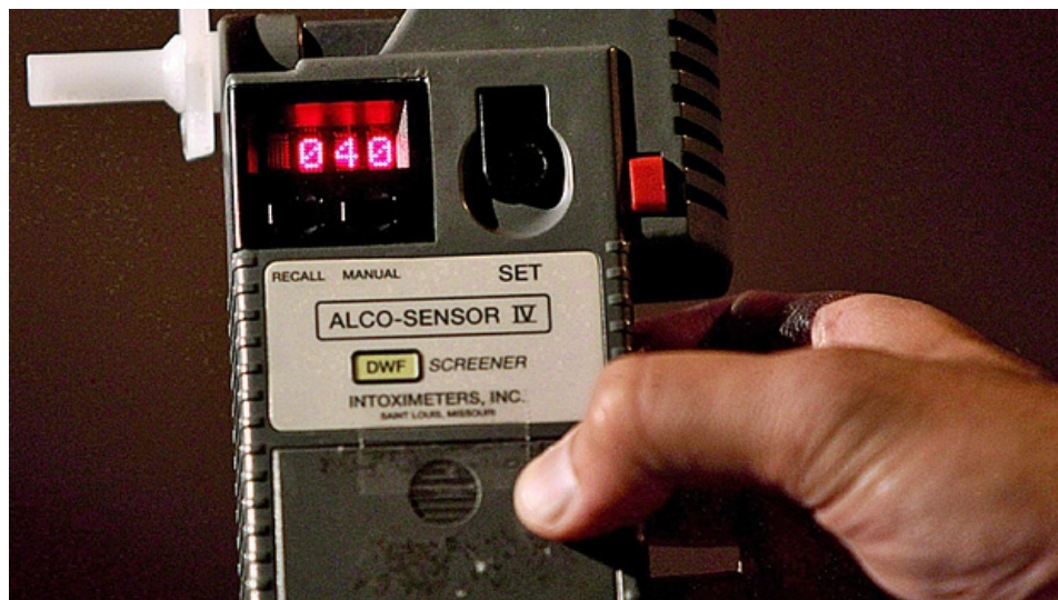
Impaired driving charges tripled in Saskatchewan in July compared to a year ago.

CBC News Posted: Aug 25, 2016 1:16 PM CT | Last Updated: Aug 25, 2016 1:16 PM CT