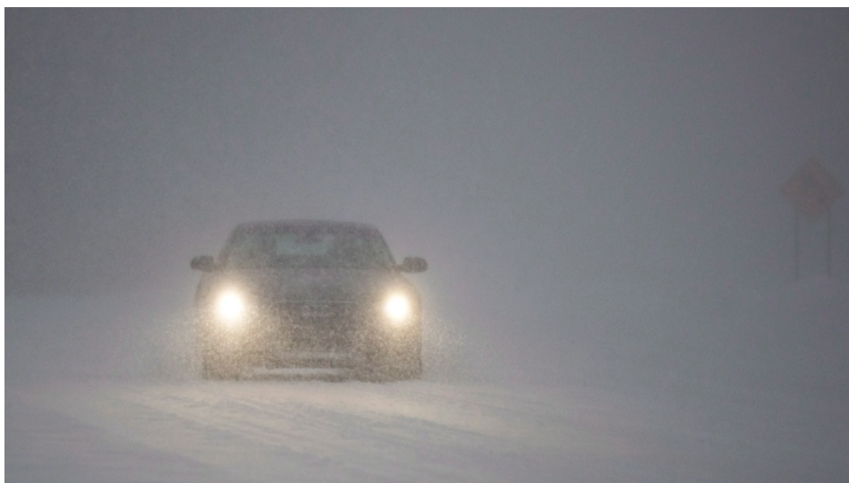
Environment Canada says a major winter storm system is expected to arrive in southeastern parts of Saskatchewan on Monday.

CBC News Posted: Mar 05, 2017 8:28 AM CT | Last Updated: Mar 05, 2017 8:28 AM CT