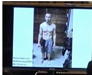
Pistorius was photographed in bloody prosthetics