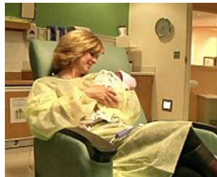
Baby-Cuddling grandma holds unexpected patient