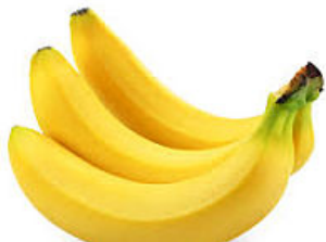
Which Food Causes The Most Weight Gain?