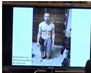
Pistorius was photographed in bloody prosthetics