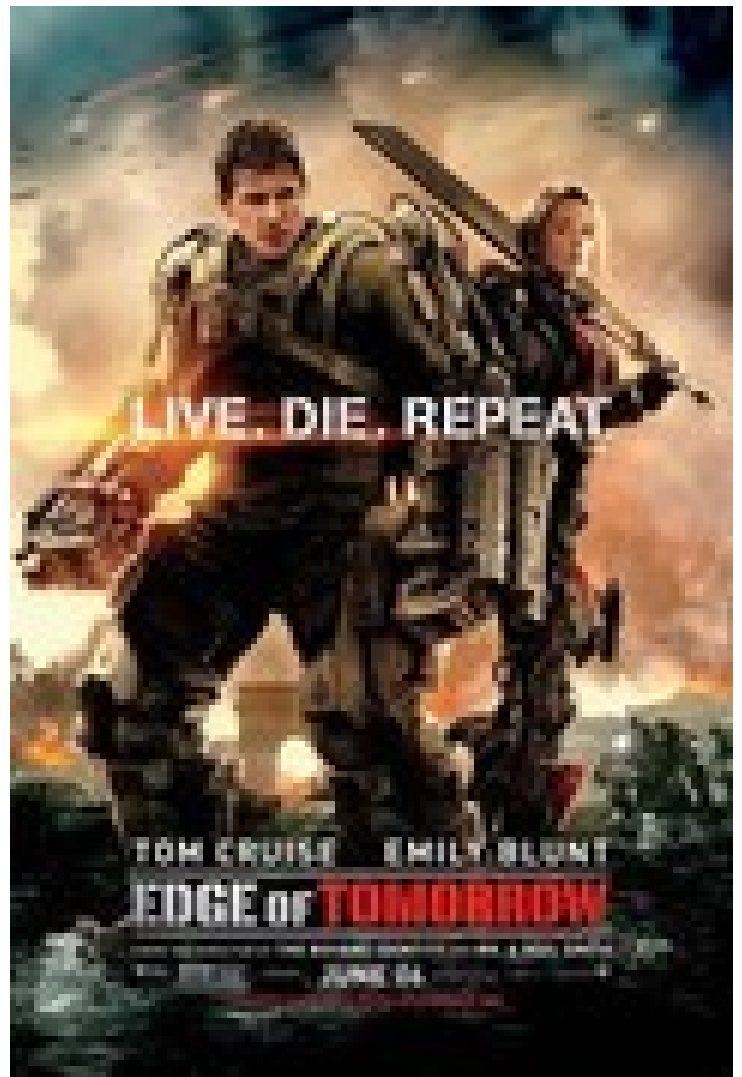
Edge of Tomorrow ★ ★ ★ ◀