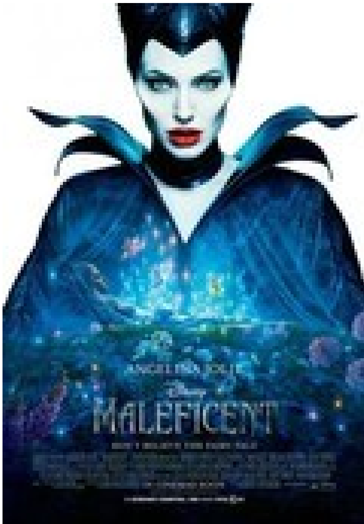
Maleficent ★ ★ ★