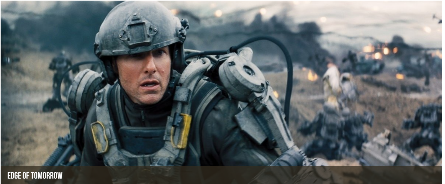
EDGE OF TOMORROW

★ ★ ★ ★ | Matt Zoller Seitz June 6, 2014 | 104