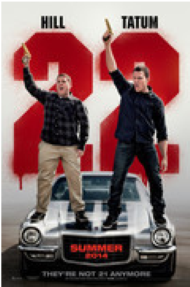
22 Jump Street ★ ★ ★