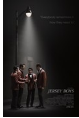
Jersey Boys ★ ★