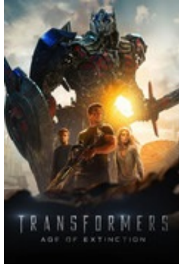
Transformers: Age of Extinction ★ ★ ☆

★ ★ ★ ☆ Whitey: United States of America v. James J. Bulger