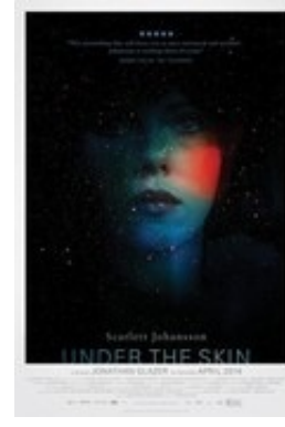
Under the Skin ★ ★ ★ ★