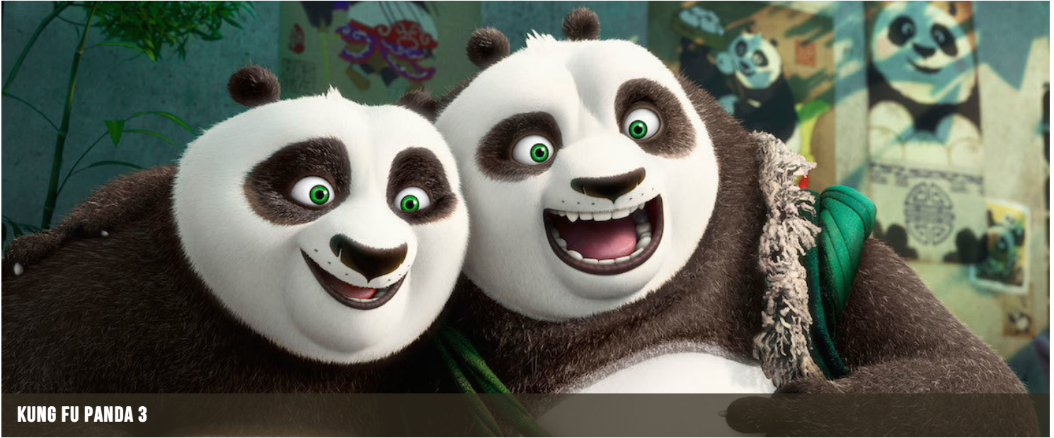
KUNG FU PANDA 3