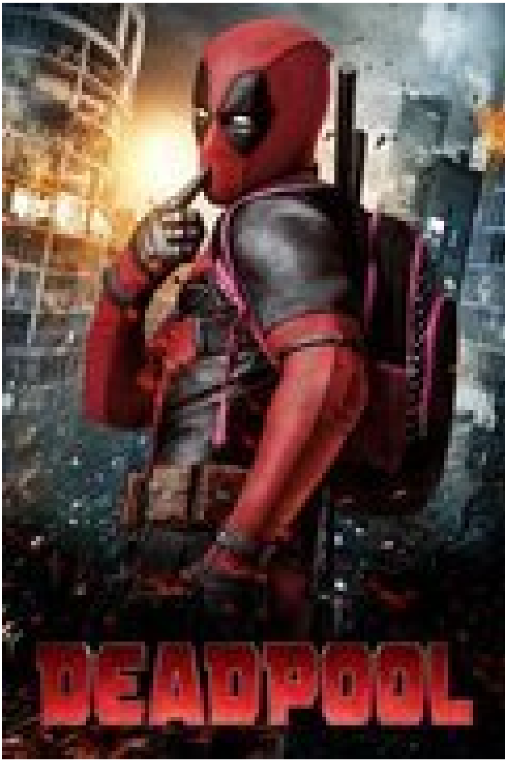
Deadpool □ □