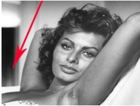
57 Completely Unsettling Historical Photos Viral Boom