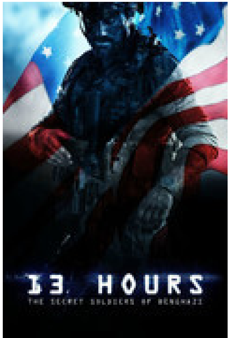
13 Hours: The Secret Soldiers of Benghazi