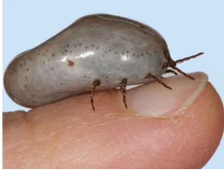
If You Have Gas, Bloating, Constipation or an Upset Stomach Please Watch This Probiotic America