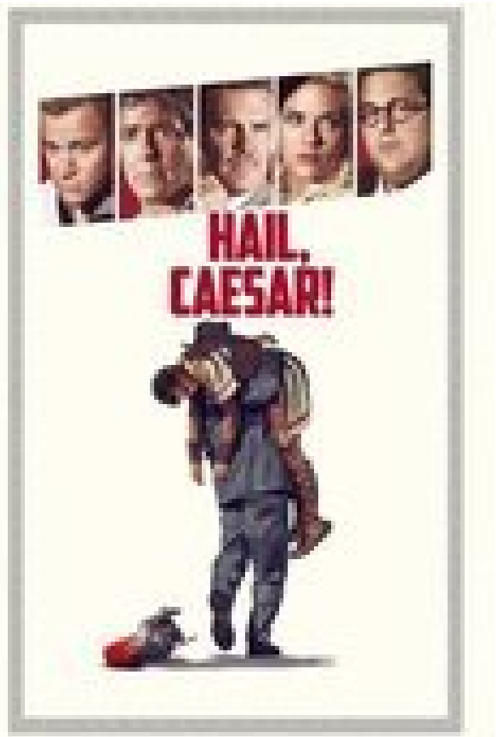
Hail, Caesar! □ □ □ □