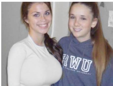
Most Random Hilarious Photos Captured Online Auto Overload