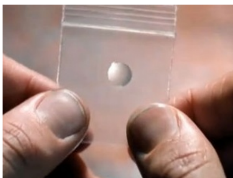
Is this "Genius Pill" really BANNED in 49 States Except Virginia? BrainHackNews