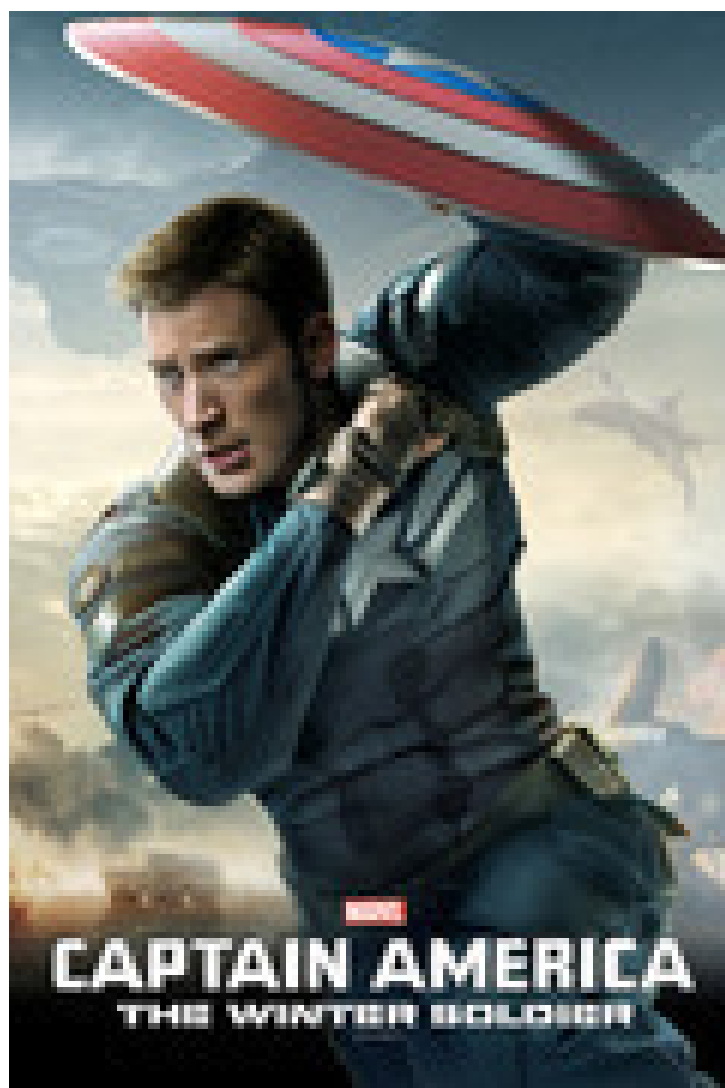
Captain America: The Winter Soldier