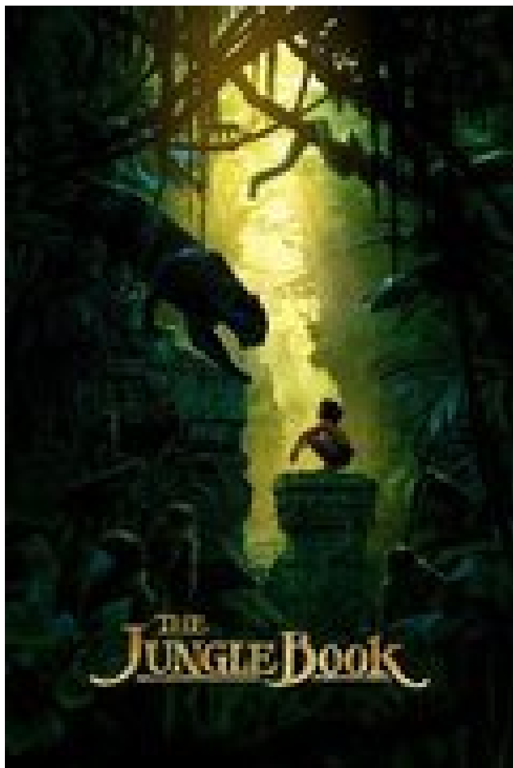
The Jungle Book