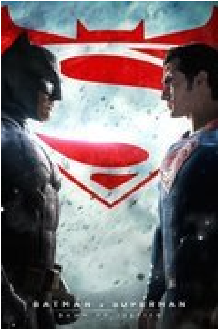
Batman v Superman: Dawn of Justice