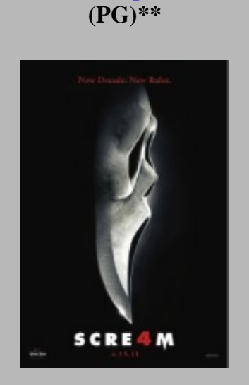
Scream 4 (R)**