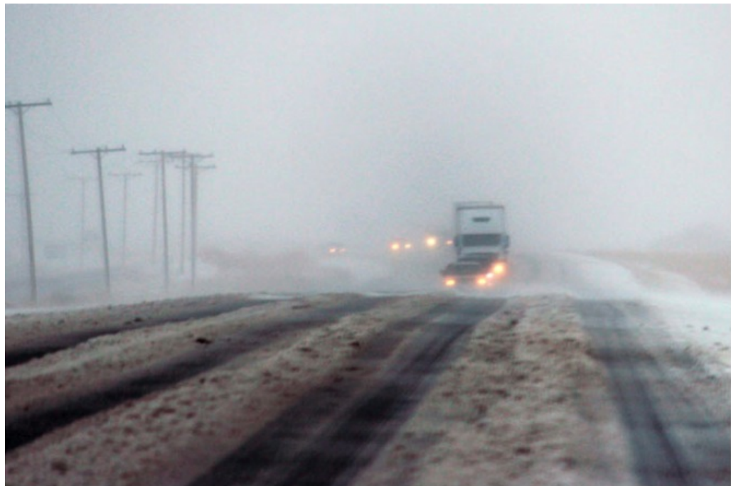
heading west on highway #16 near Wynyard Friday, April 6, 2012 at 5:47