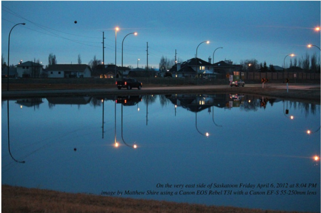
On the very east side of Saskatoon Friday April 6, 2012 at 8:04 PM