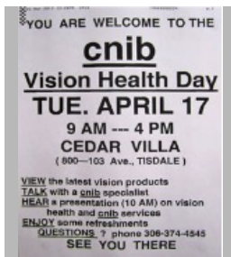
click here to see the above poster full size