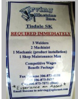
click here to see the above poster full size