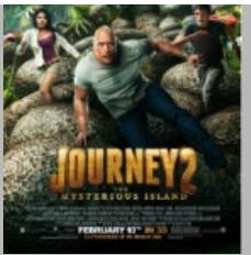
Journey 2: The Mysterious Island (PG)**