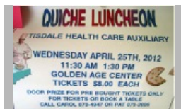
click here to see the above poster full size