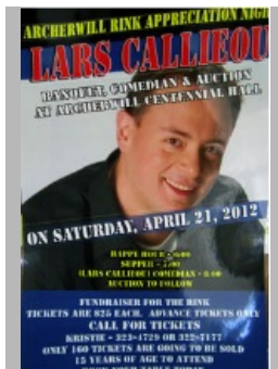
click here to see the above poster full size