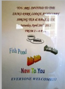
click here to see the above poster full size