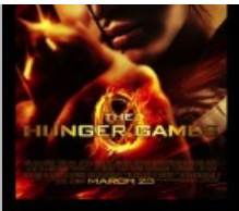
The Hunger Games (PG-13)***