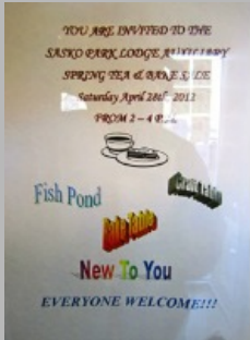
click here to see the above poster full size