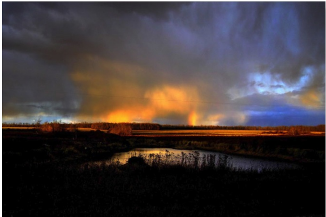
Bj Madsen's Parkland Photography Club third place image of "storm clouds"