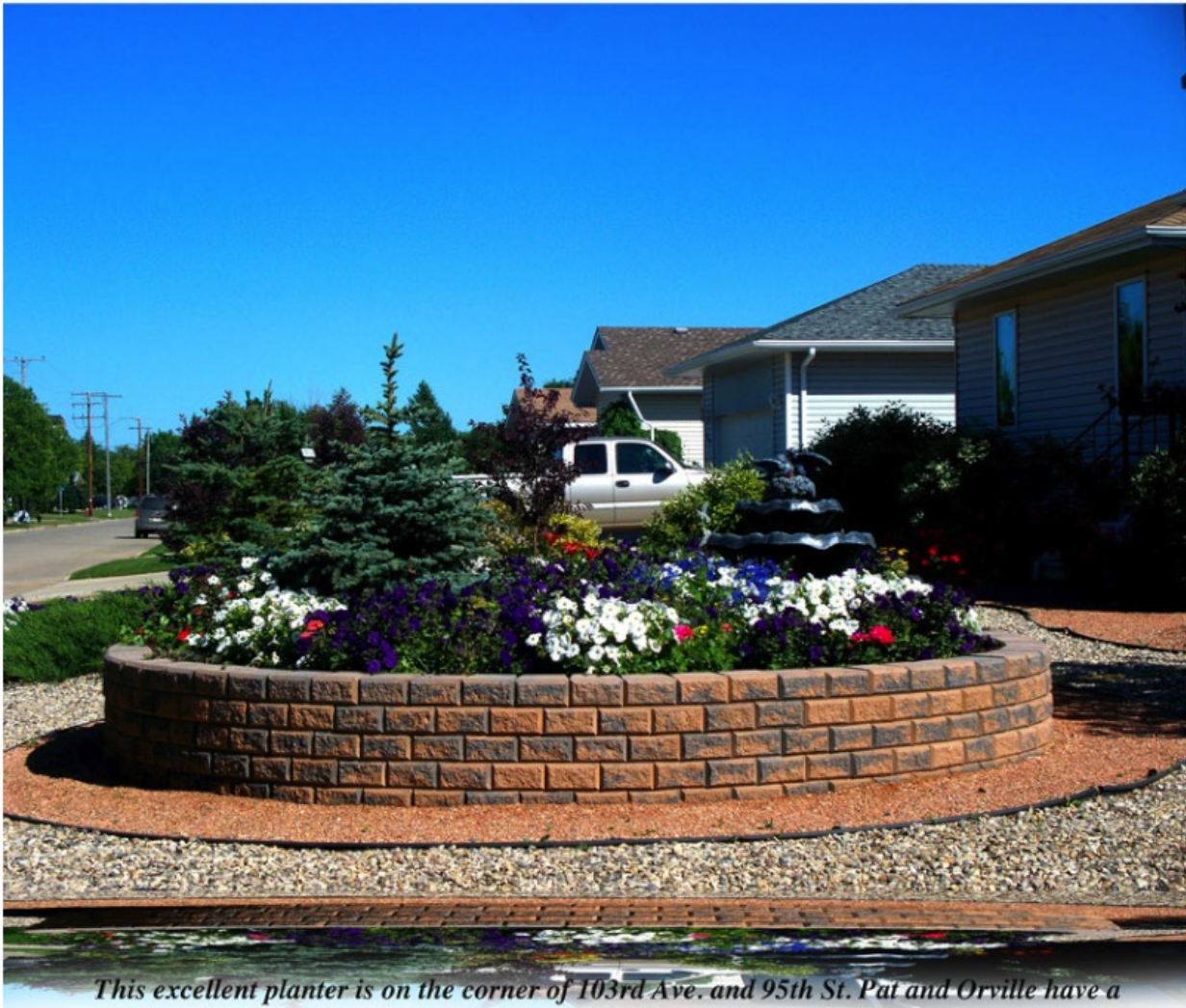
This excellent planter is on the corner of 103rd Ave. and 95th St. Pat and Orville have a corner lot without a single blade of grass. Wednesday, August 3, at 4:03 pm.