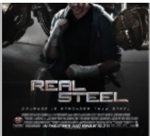
Real Steel (PG-13)***