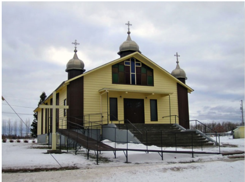
A Porcupine Plain landmark as seen again the gloomy sky at 2:00 PM Saturday, December 2, 2011