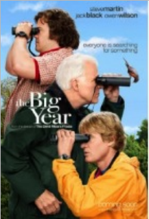
The Big Year (PG)***