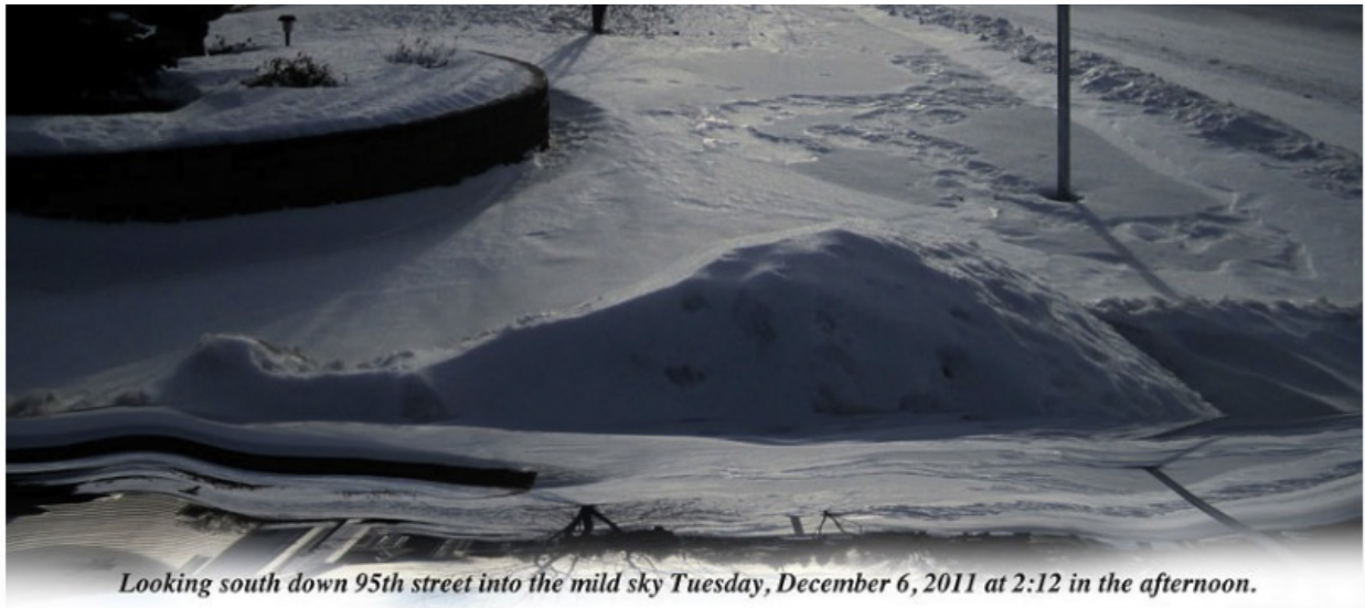
Looking south down 95th street into the mild sky Tuesday, December 6, 2011 at 2:12 in the afternoon.