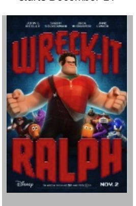
Wreck-It-Ralph (PG) ***

The Falkon Theatre in Tisdale will be closed until the first weekend in January