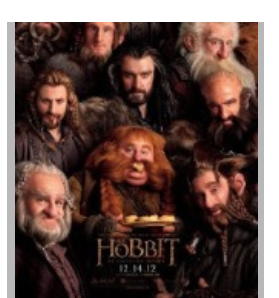
The Hobbit: An Unexpected Journey (PG-13) ***

The Dynasty Theatre in Melfort will be closed Christmas Eve and Christmas Day