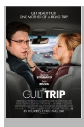
The Guilt Trip (PG-13) ***