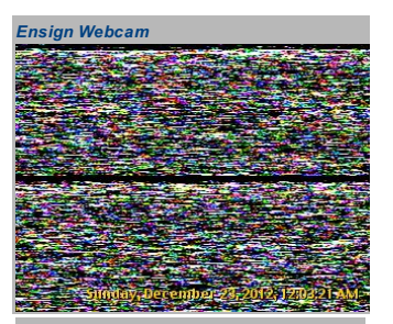
Today In Ensign

Pretty hard for everyone who as heard of the murder of children and teachers at Sandy Hook Elementary in Connecticut. This is just another you to look at this count.