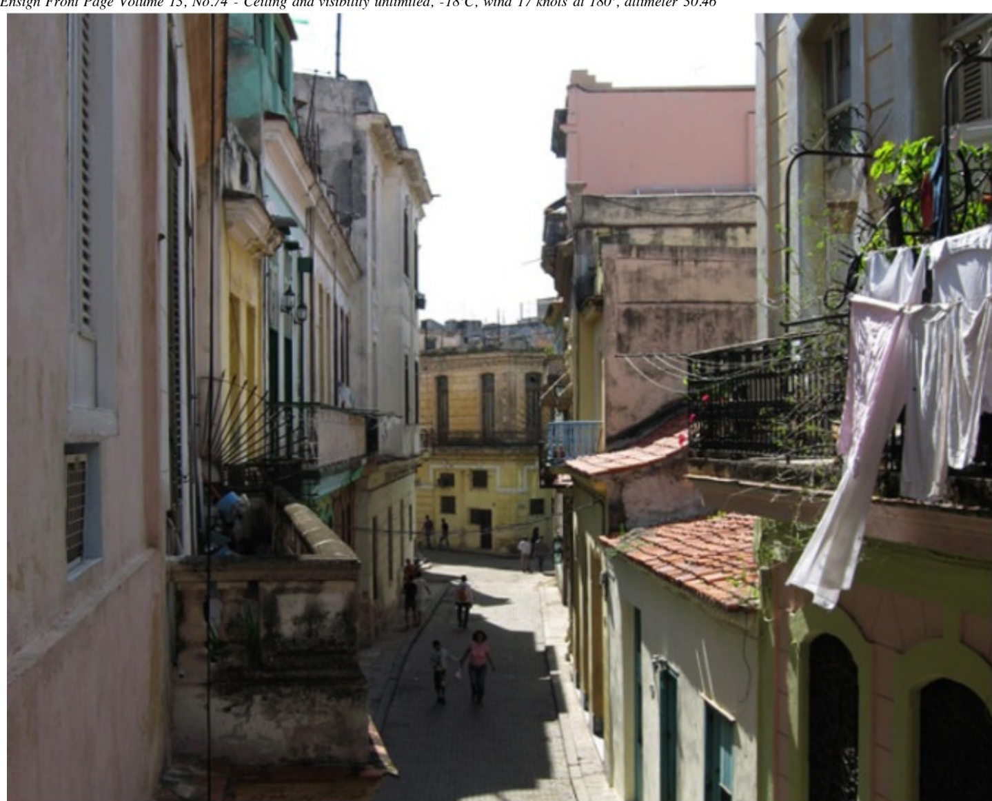
Cassandra Shire's shot of a Havana street from an apartment balcony taken Saturday, January 15