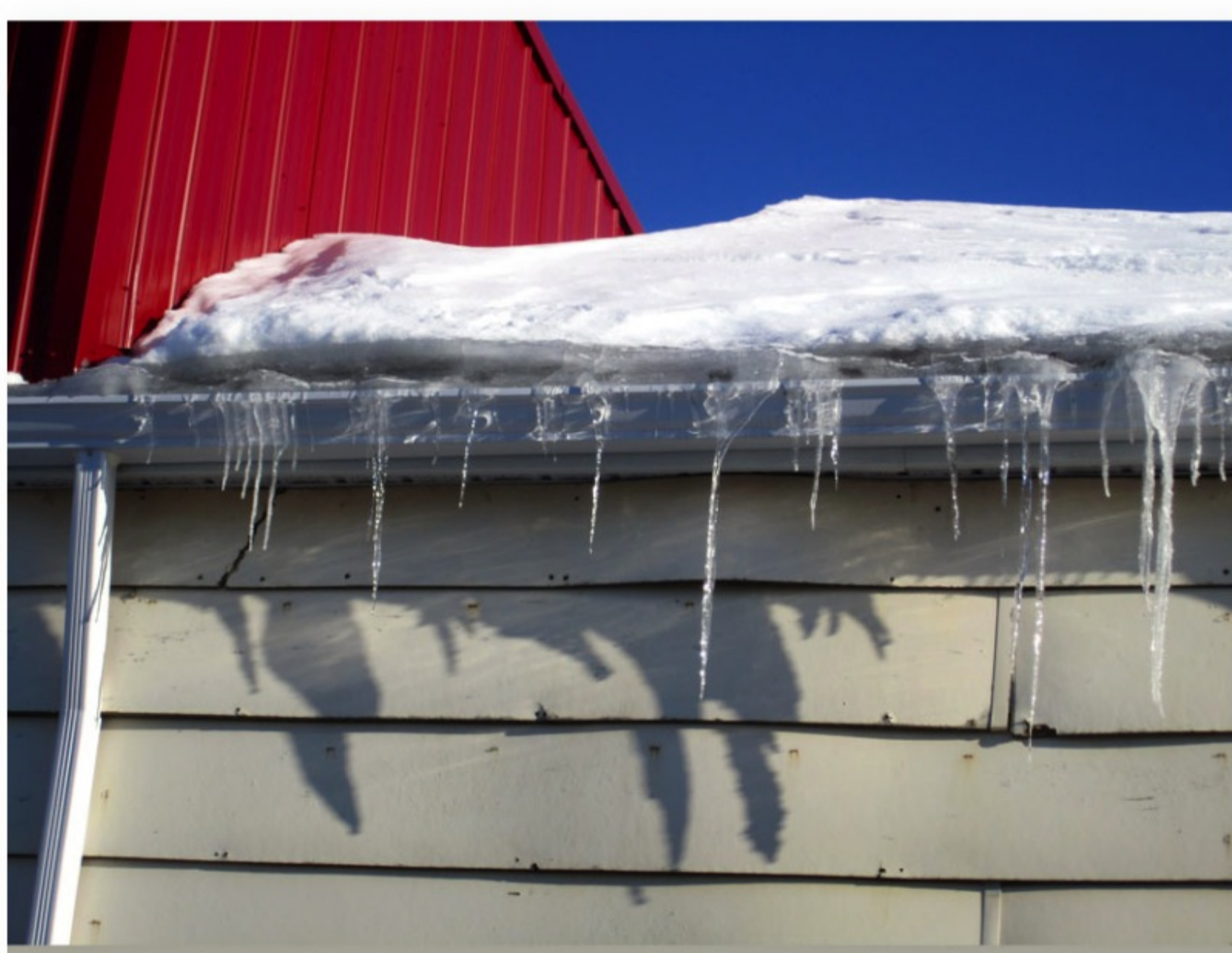
We are into the season of extreme temperatures, after a week of just at freezing we have endured a week of arctic temperatures and expect to warm up considerably by the weekend. Heavy snow on the top of building leads to the formation of ice-damms. This one on a downtown building as seen at 3:04 on Monday afternoon.

Google Search WWW Search ensign.flcomm.com