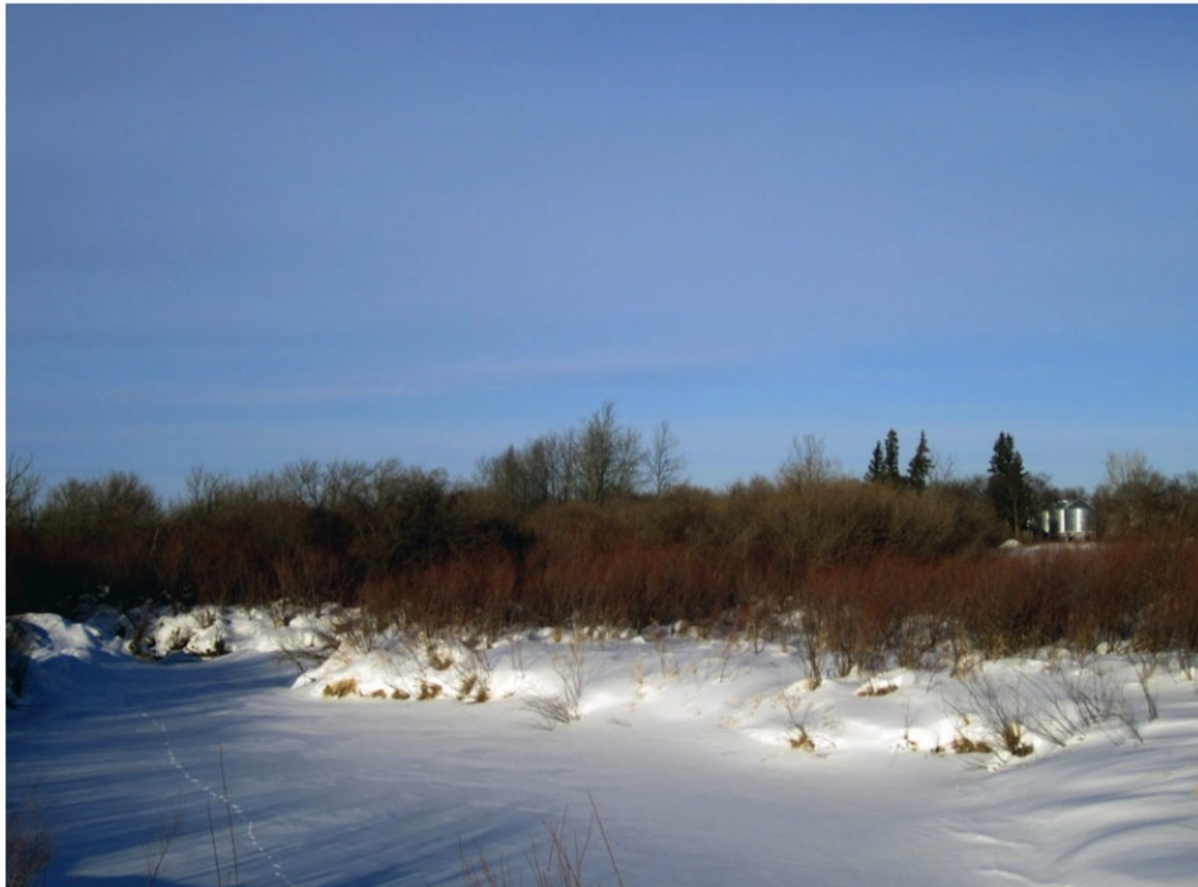
Northeast of Tisdale at 4:02 Wednesday afternoon. Though there was a stiff southwest wind the temperature edged up to -5°C by late afternoon on this 2011 groundhog day.