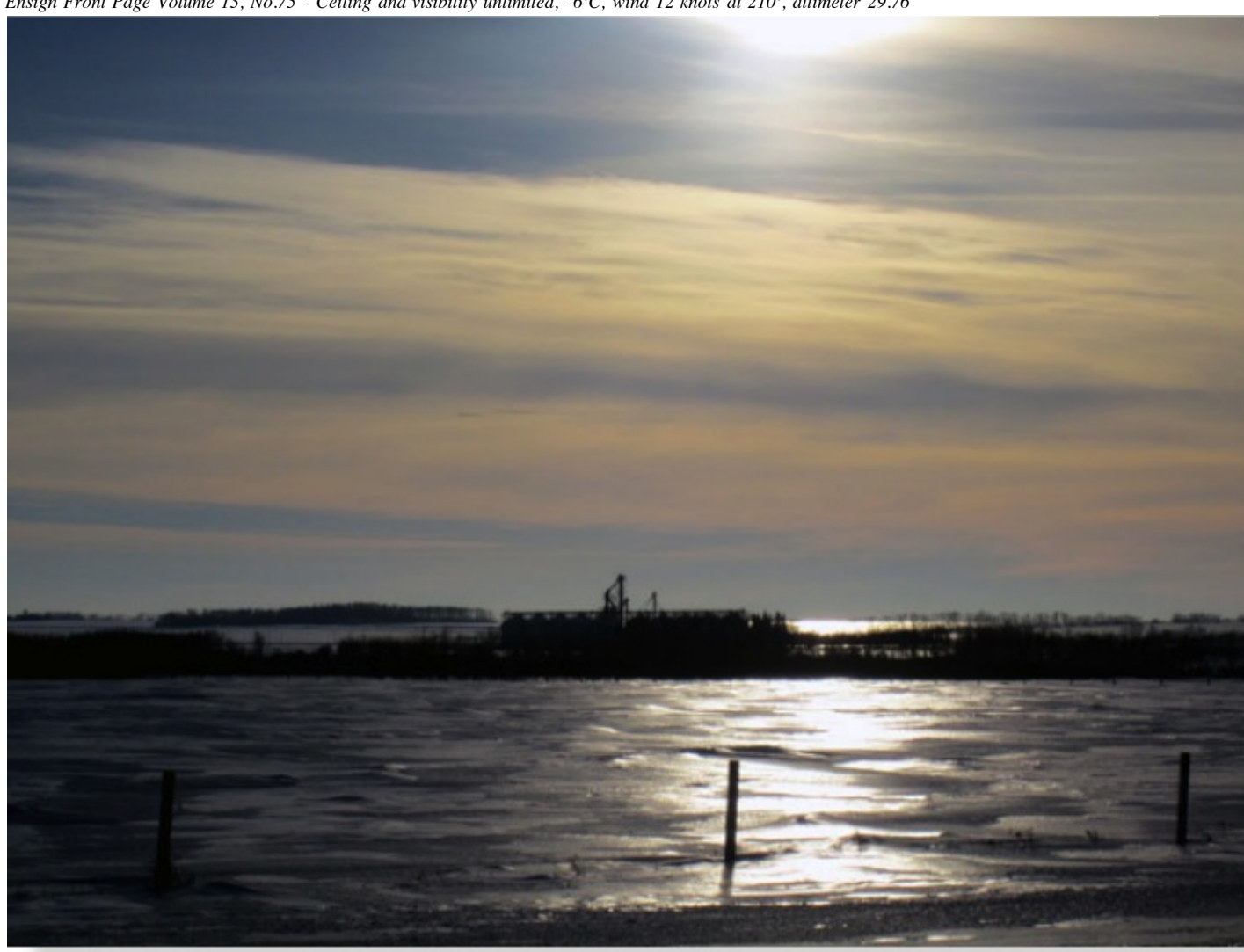
That shine on the snow is a sign of things to come. Looking from highway #3 toward Louis Dreyfus at 4:16 this afternoon