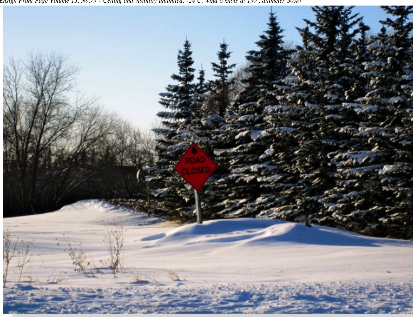
North of Tisdale on the old highway at 5:01 this Saturday, February 19th afternoon