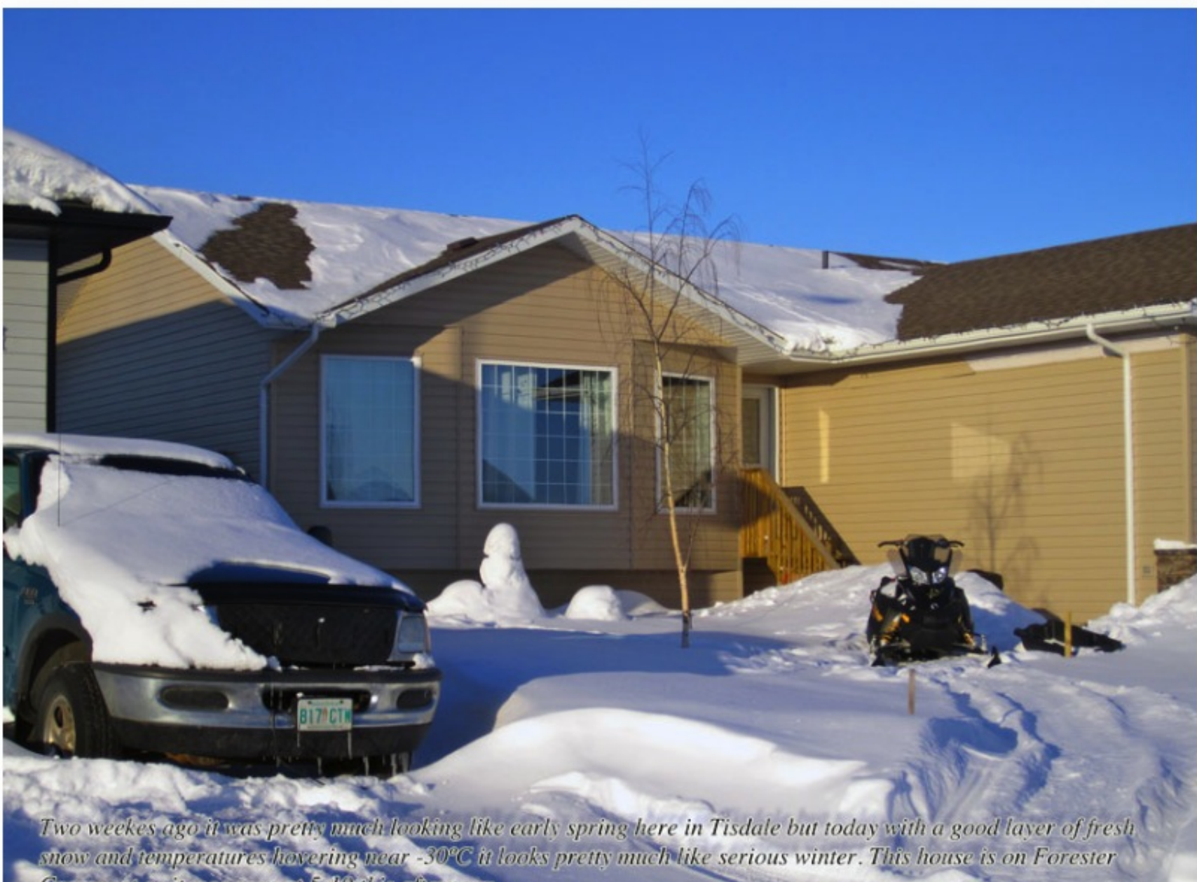
Two weeks ago it was pretty much looking like early spring here in Tisdale but today with a good layer of fresh snow and temperatures hovering near -50°C it looks pretty much like serious winter. This house is on Forester Cresence as it was seen at 5:10 this afternoon.