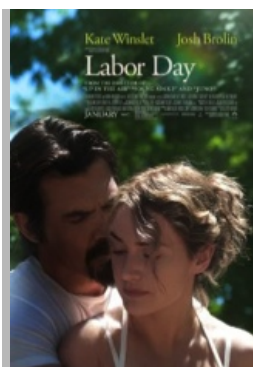
Labor Day (PG-13) **