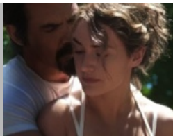
Labor Day (PG-13) ** 7:00 & 9:00