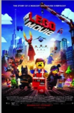
The Lego Movie (PG) **** 7:00 & 9:00 matinees Saturday and Sunday at 2:00 pm