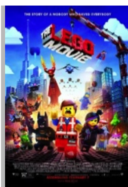
The Lego Movie