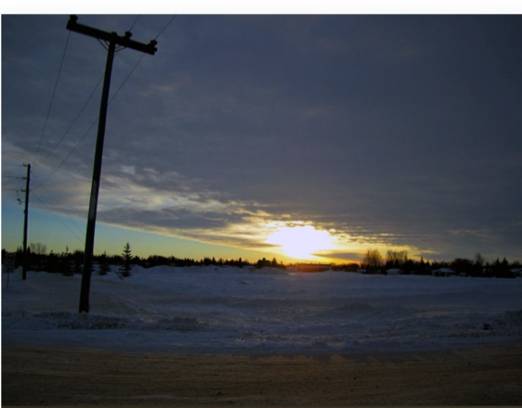
Judy Shire caught this occlusion at 9:19 in the morning on Wednesday January 26th. This is looking from Heritage Road across Tisdale at the rising sun. The snow piled in the field north of Tisdale Elementary School is the area cleared for construction to begin on the new Caleb condominium project that was officially launched on Wednesday.