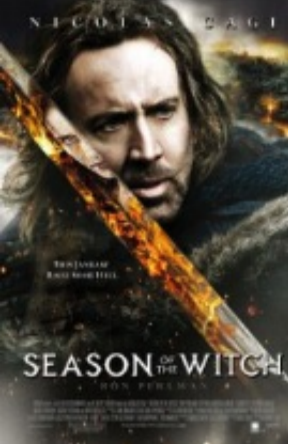
Season of the Witch (PG-13)**