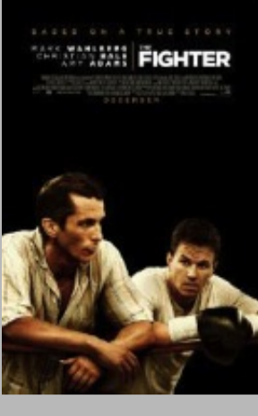
The Fighter (R)**