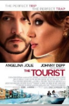
The Tourist (PG)**