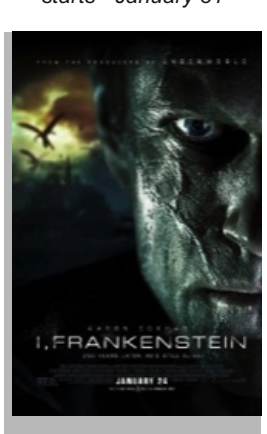
I, Frankenstein (PG-13)*