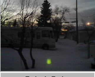
Today In Ensign