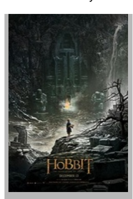
The Hobbit:The Desolation of Smaug (PG-13) ***