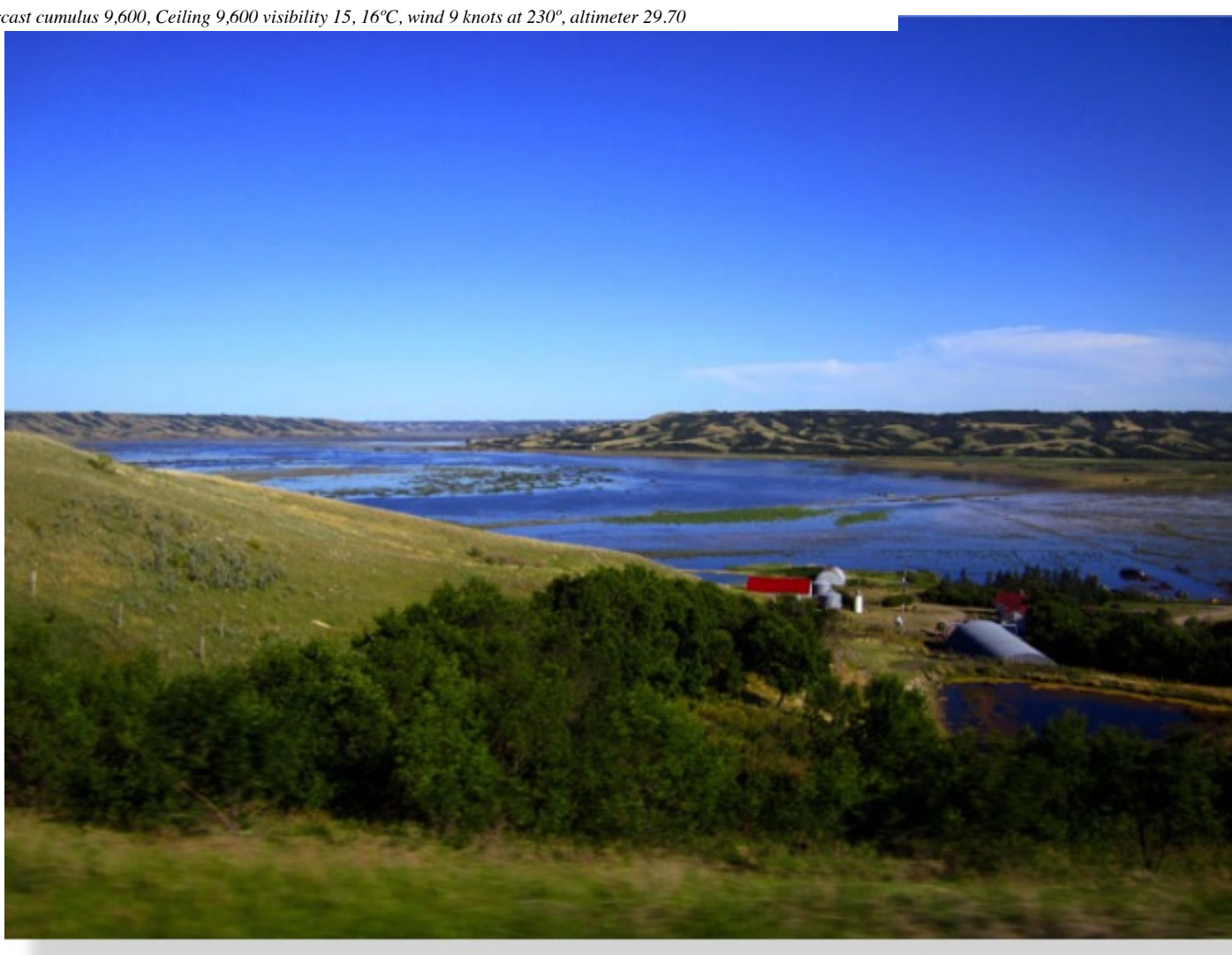
The Qu' Appelle Valley south of Southey from #6 highway looking east, Monday, July 25, 2011 at 5:38 pm by Judy Shire.