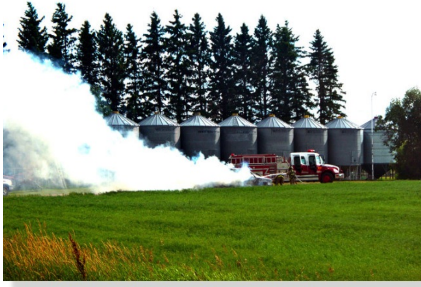
At the G&G Edmunds farm near Eldersley at 4:38 PM, Thursday, July 28, 2011..