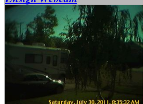
Today In Ensign

TWS - Pick-up burns near Eldersley TWS - Tisdale Air Rally