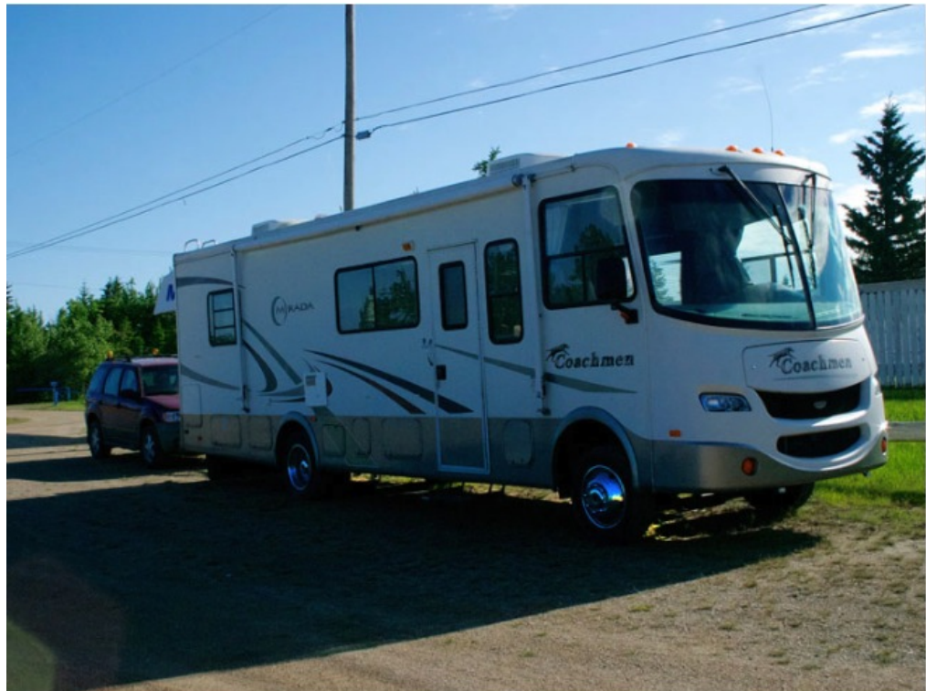
Travel time for Ensign this summer: First stop in Watson, June 21, 2012