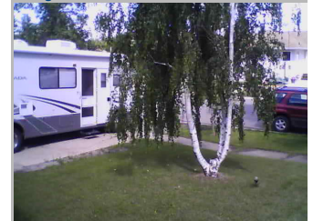
Today In Ensign

TWS - Grand Forks TWS - Canada Day in YPG