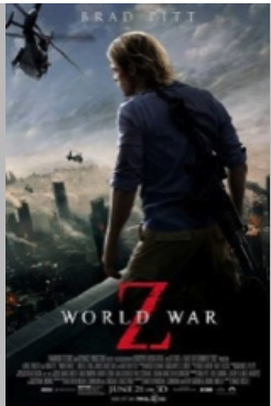
World War Z (PG-13) **