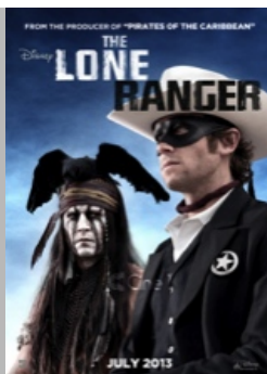
The Lone Ranger (PG-13) ****