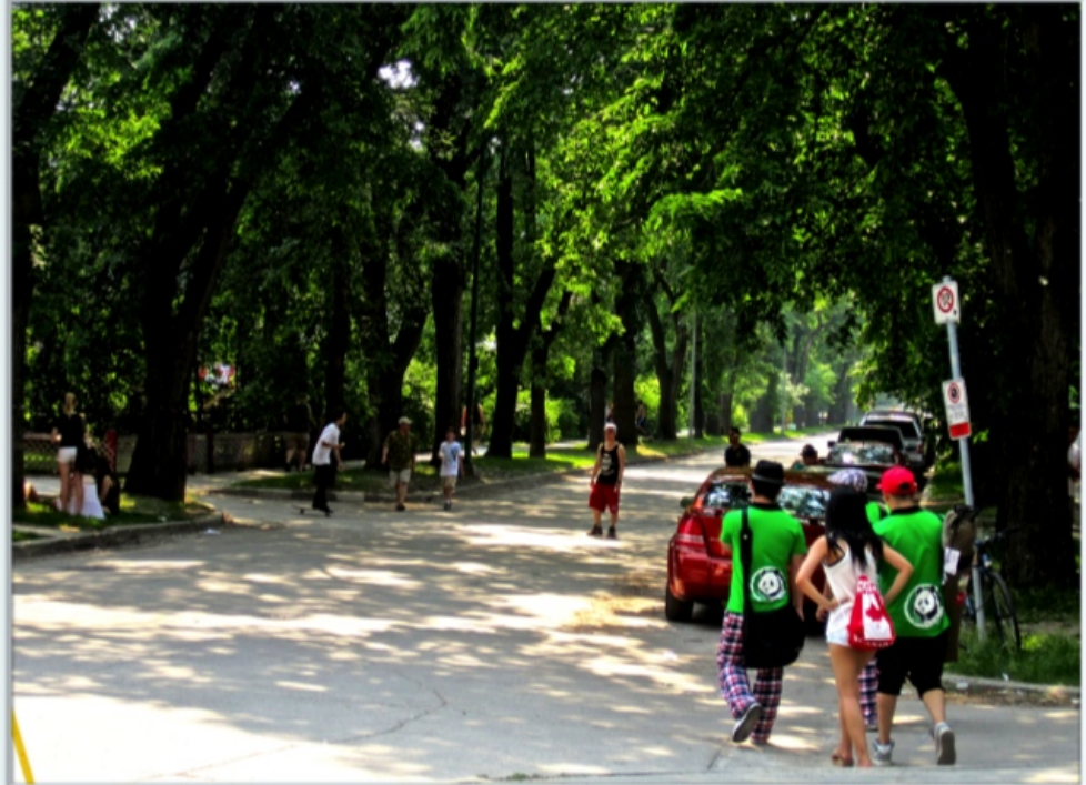
In the heart of Winnipeg on Canada looking west from Osborne St. on Monday, July 1 at 3:21 local time.