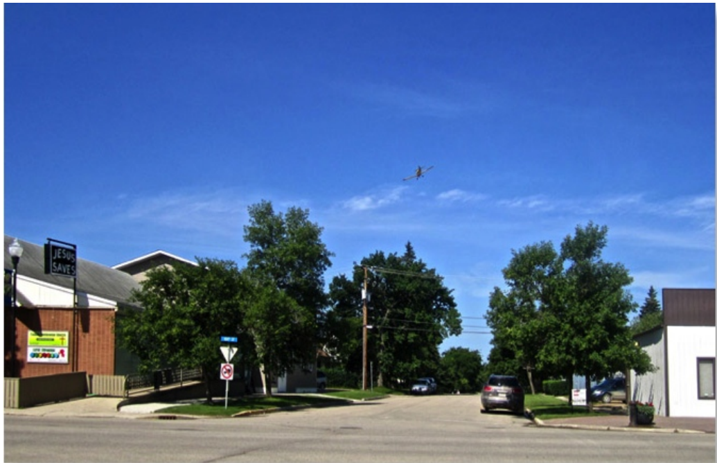
Crop spraying in progress on a Canola field just west of Tisdale this morning, Wednesday, July 10, 2013