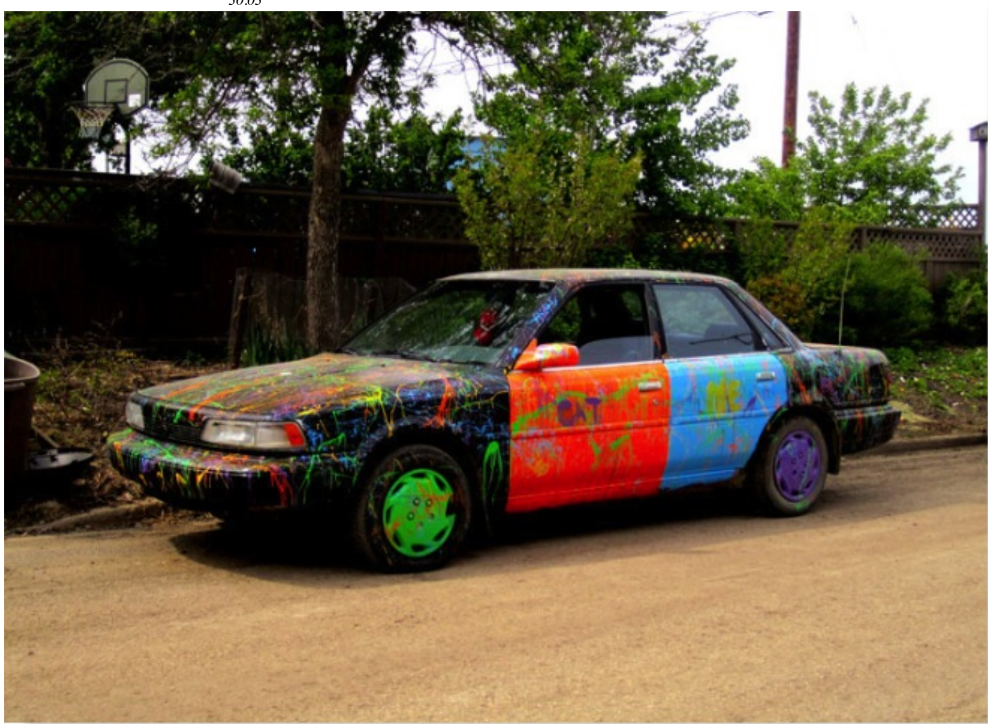
One of several Tisdale grad cars as seen Thursday June 9 at 11:07