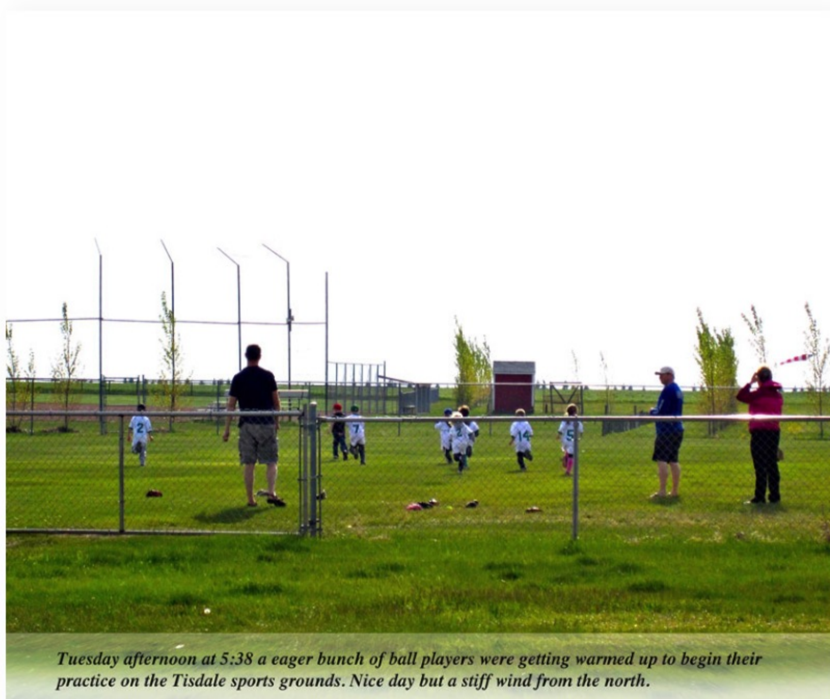
Tuesday afternoon at 5:38 a eager bunch of ball players were getting warmed up to begin their practice on the Tisdale sports grounds. Nice day but a stiff wind from the north.