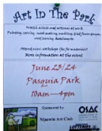
click here to see the above poster full size

pictures" to see 24 images of a greenhouse.