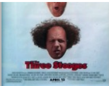
The Three Stooges: Just Say Moe (PG)***