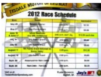
click here to see the above poster full size