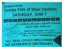
click here to see the above poster full size