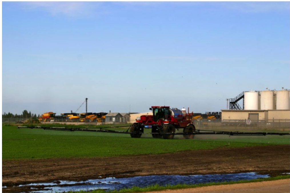
Sprayer in action just west of Tisdale at 4:40 PM Thursday, June 7, 2012