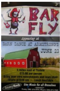
click here to see the above poster full size